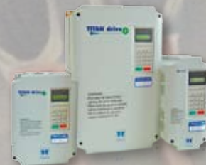
Titan Drive TTD300