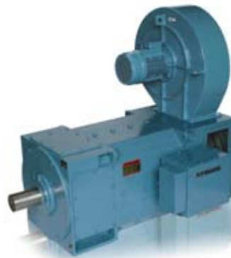
LAKC 200 – 2000 kW