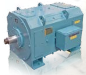
Mill Duty 7,5 – 147 kW