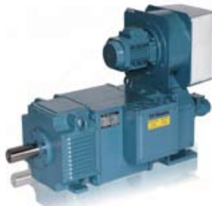
LAK4000/DMP 1 – 550 kW