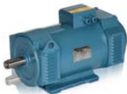
LAK2000 0,5 – 20 kW